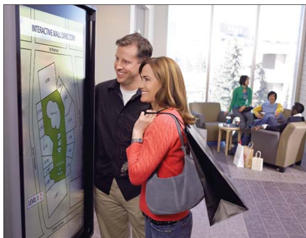
Touch the interactive screen to find digital information.